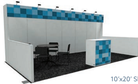
10'x20' Shell Scheme