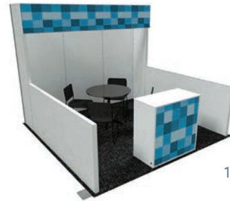
10'x10' Shell Scheme