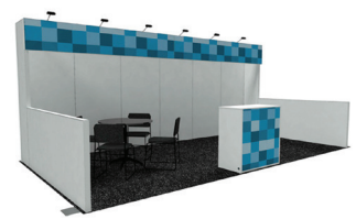
10'x20' Shell Scheme

* Linear booths with open corner(s) are charged $500 per corner.