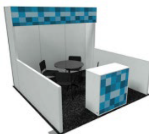
10' x 10' Shell Scheme

**Member Discount for Exhibitors: Company must be an AUVSI member (Industry level or higher) at the time of contracting through the time of the show.